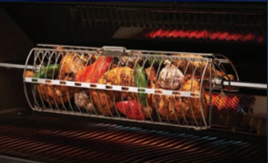
ROTISSERIE RACK 64005