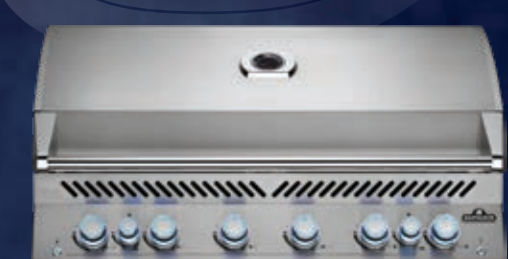
44" with Dual Infrared Rear Burners