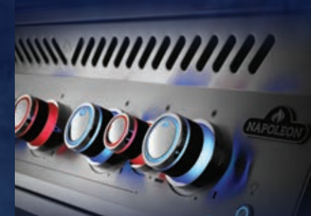
NIGHT LIGHT™ Control Knobs with SafetyGlow

The control knobs with SafetyGlow turn red when a burner is in use