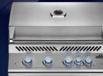
32" with Infrared Rear Burner