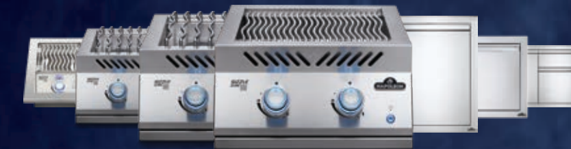
WITH ALL NEW Drop-In Burners, Zero Clearance Liners, Doors and Drawers