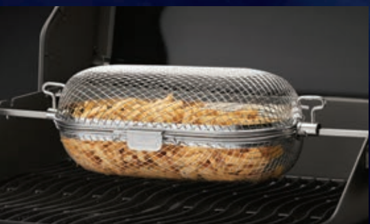
ROTISSERIE GRILL BASKET 64000