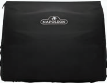
PREMIUM GRILL COVER DESIGNED FOR: Built-In 32" Grill (BIG32RB) 61830