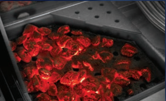
CAST IRON CHARCOAL AND SMOKER TRAY 67732

✓ Outdoor cooking accessories that fit all Built-In 700 Series Grills