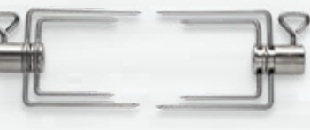
COMMERCIAL QUALITY COLLAPSIBLE ROTISSERIE FORKS - 2PC DESIGNED FOR: Universal for all square and hex shaped spit rods 69002