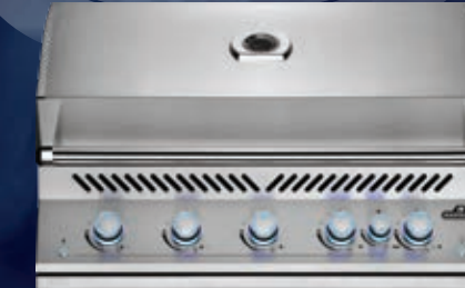
38" with Infrared Rear Burner