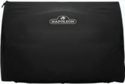
PREMIUM GRILL COVER DESIGNED FOR: Built-in 38" Grill (BIG38RB) 61836