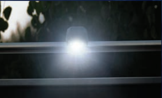
GRILL LIGHT 70049