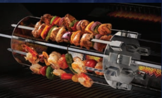
ROTISSERIE SHISH-KEBAB SKEWER SET 64008