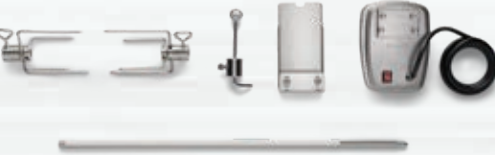
ADD-ON ROTISSERIE KIT WITH 2PC ROTISSERIE FORKS AND COMMERCIAL QUALITY MOTOR DESIGNED FOR: Built-in 44" Grill (BIG44RB) 69851