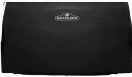
PREMIUM GRILL COVER DESIGNED FOR: Built-in 44" Grill (BIG44RB) 61842