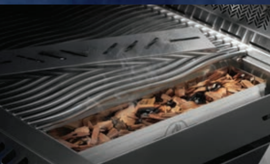
STAINLESS STEEL SMOKER BOX 67013