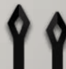
STEEL ANDIRONS IN CHARCOAL FINISH