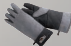
HEAT RESISTANT GLOVES INCLUDED