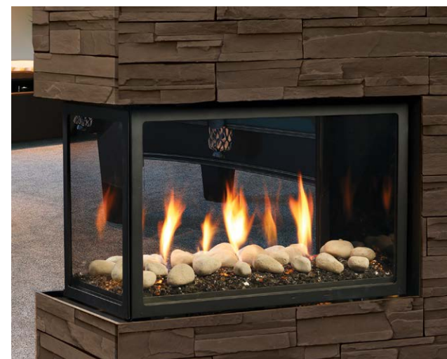
Unit illustrated is a MCVP42NH Peninsula Fireplace - Natural Gas, MP42GT Glass Tray, MQG5C Glass Media - Bronze x (5), MQROCK2 Rock Set - Contemporary Collection - Natural, MP42PL Porcelain Reflective Liner.