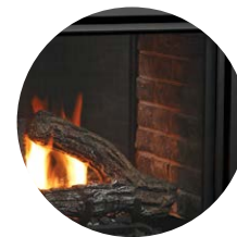
SAFETY SCREEN BARRIER