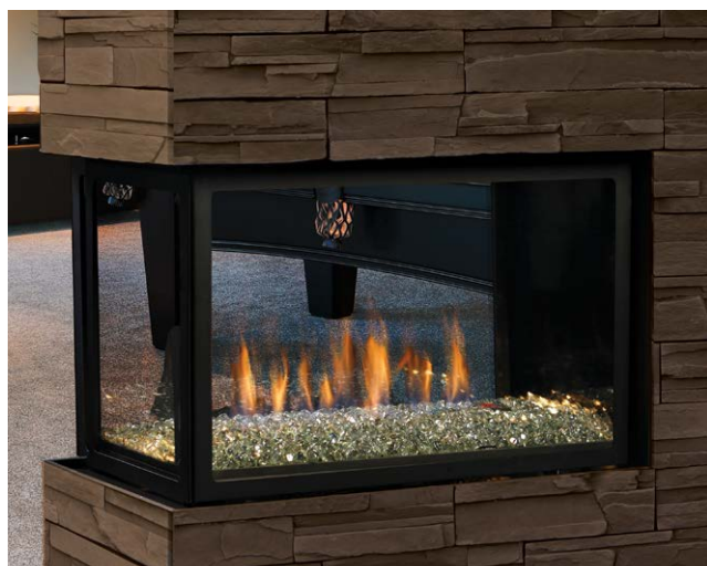
Unit illustrated is a MCVP42NH Peninsula Fireplace - Natural Gas, MP42GT Glass Tray, MQG5ZG Glass Media - Zircon Ice x (5), MP42PL Porcelain Reflective Liner.

* All gas fireplaces manufactured as of January 1, 2015 will include a Safety Screen Barrier.