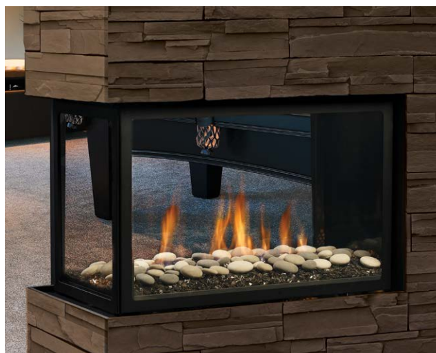
Unit illustrated is a MCVP42NH Peninsula Fireplace - Natural Gas, MP42GT Glass Tray, MQG5C Glass Media - Bronze x (5), MQSTONE Decorative Stones, MP42PL Porcelain Reflective Liner.